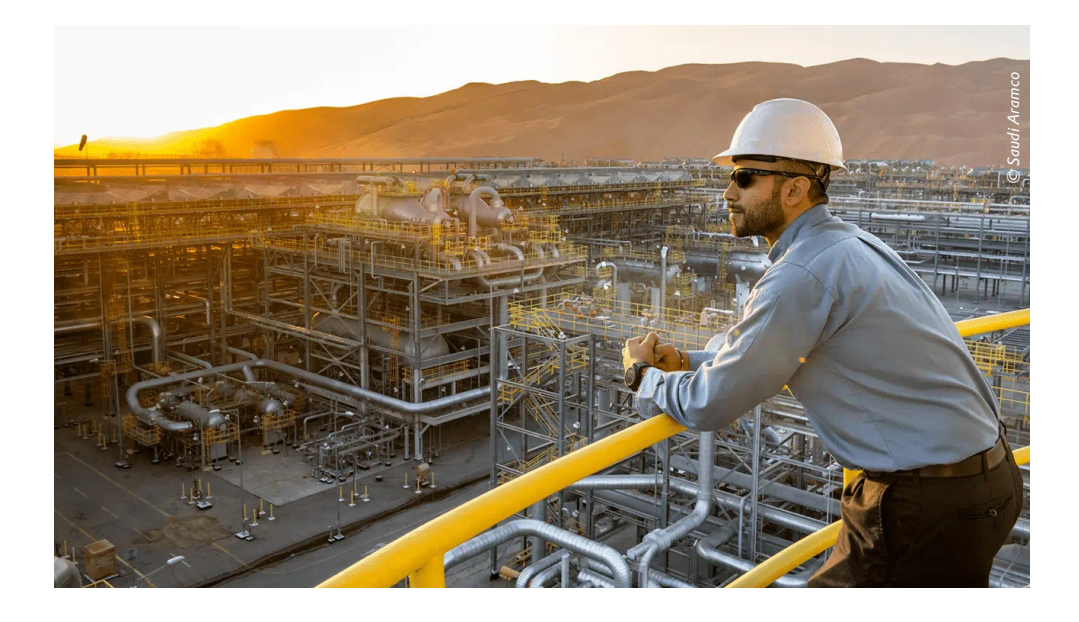
The Shaybah field is located at the northern edge of the Rub' al Khali desert known as the "Empty Quarter" in Saudi Arabia.