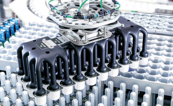
Using additive manufacturing reduced part complexity of a vacuum gripper for coffee cream portion packs from 192 turned parts, 18 complex milling parts and 1,024 screws to three parts and eight screws, cutting assembly time from one day to 10 minutes.

To achieve the required stability and reliability, Schubert Additive engineers leveraged the tools for design, topology and build preparation optimization included in NX for AM. This included slicing software, which they had been using previously with their off-the-shelf 3D printer. When they switched to NX it did not require any changes to programming.