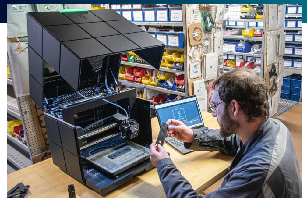
The Siemens Additive Manufacturing Network is used to receive CAD data for additive re-engineering and is seamlessly integrated into Partbox OS.

"We used our digital transformation to revolutionize part distribution and production."