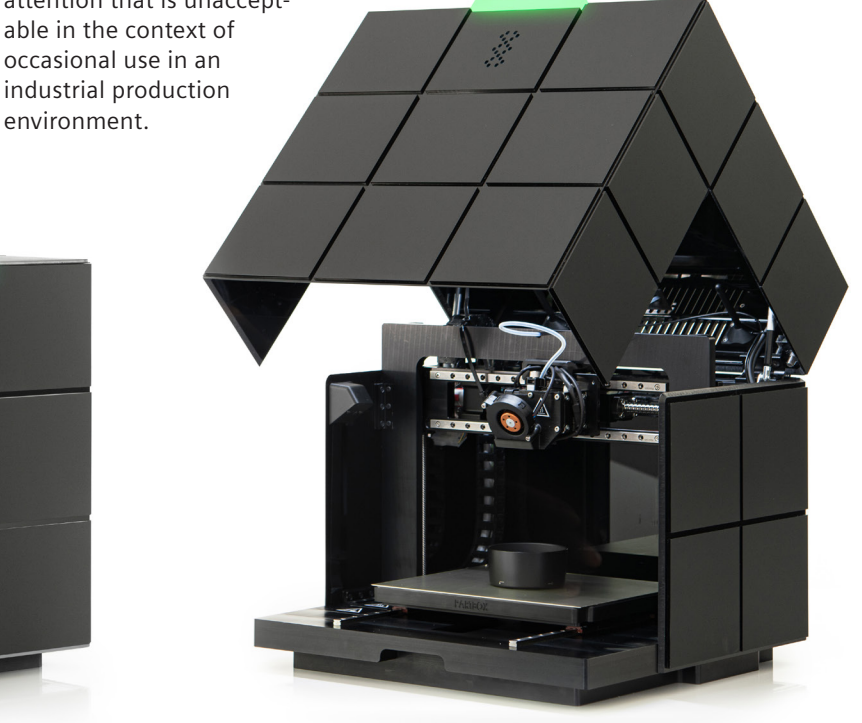
Schubert Additive used NX to create the Partbox industrial-grade 3D printer capable of a ±0.1 mm dimensional accuracy. Working with a plastics manufacturer, they also created a filament material to use for optimal results.